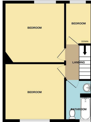
1ST FLOOR 430 sq.ft. (39.9 sq.m.) approx.